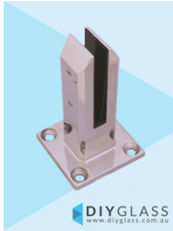
Square Base Plate Spigot