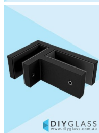
Black Glass Glass 90 Degree Bracing