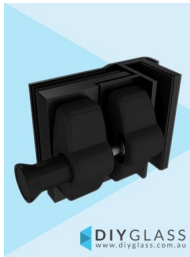
Black Glass Gate Latch for External Glass to Glass