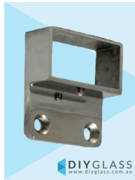
50x25mm Wall Plate for Glass Offset Rail