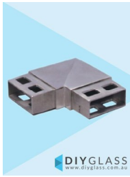
50x25mm 90 Degree Joiner for Glass Offset Rail