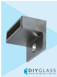
50x10mm Wall Plate for Glass Offset Rail