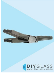
50x10mm Adj. Vertical Joiner for Glass Offset Rail