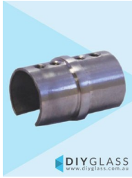
38mm In-Line Joiner for Glass Top Rail