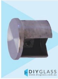
38mm End Cap for Glass Top Rail