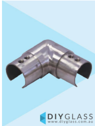
38mm 90 Degree Radius Joiner for Glass Top Rail