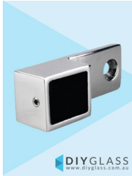
25x21mm Tube Extended Wall Bracket