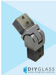
25x21mm Adj, Vertical Joiner for Glass Top Rail