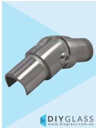
25.4mm Adj. Vertical Joiner for Glass Top Rail