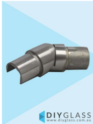
25.4mm Adj. Horizontal Joiner for Glass Top Rail