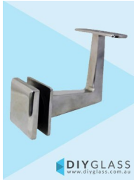
Square Offset Fixed Balustrade Handrail Bracket