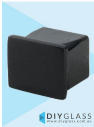
25x21mm End Cap for Glass Balustrade Top Rail