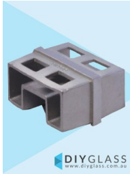
54x30mm In-Line Joiner for Glass Top Rail