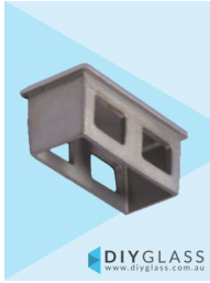
50x25mm End Cap for Glass Offset Rail