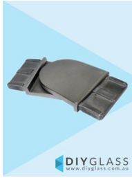
50x10mm Adj. Horizontal Joiner for Glass Offset Rail