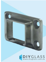
40x30mm Wall Plate for Glass Top Rail