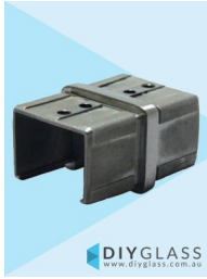
40x30mm In-Line Joiner for Glass Top Rail