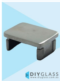
40x30mm End Cap for Glass Top Rail