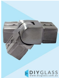
40x30mm Adj. Vertical Joiner for Glass Top Rail