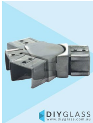
40x30mm Adj. Horizontal Joiner for Glass Top Rail