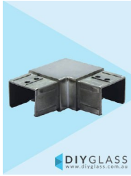
40x30mm 90 Degree Joiner for Glass Top Rail