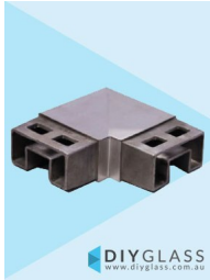
54x30mm 90 Degree Joiner for Glass Top Rail