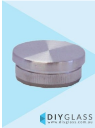
38mm Flat End Cap for Glass Balustrade Top Rail