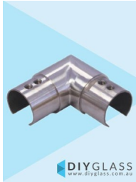
38mm 90 Degree Joiner for Glass Top Rail