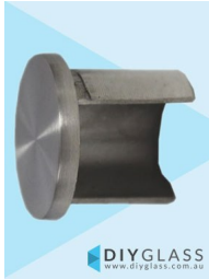
25.4mm End Cap for Glass Top Rail