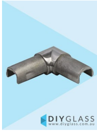
25.4mm 90 Degree Joiner for Glass Top Rail